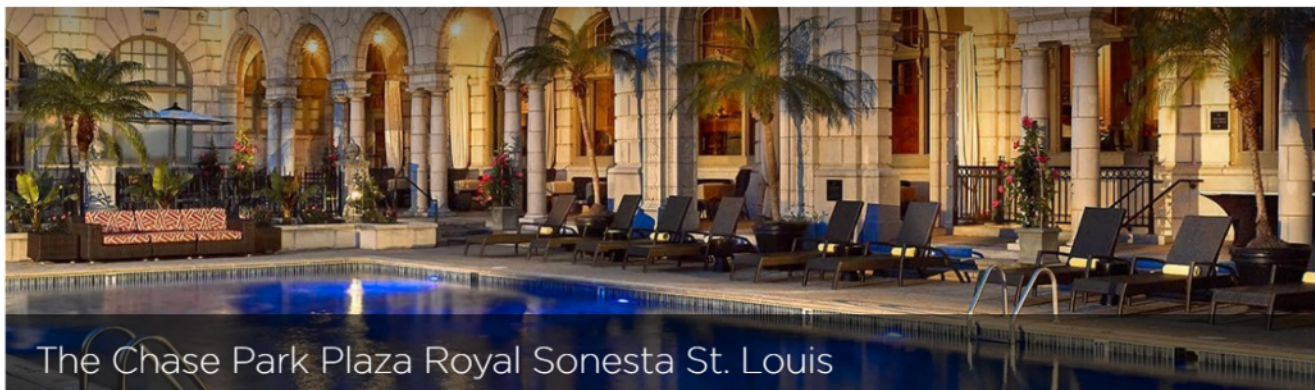
The Chase Park Plaza Royal Sonesta St. Louis

Don't miss out.... Join the Greater Saint Louis Chapter CSI for the opportunity to meet AEC Professionals from around the country, with 3 full days of networking, education and fun including a half day Product Expo !