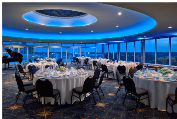
Zodiac Room location of NCR Awards Banquet

Questions: e-mail: nrc@stlouiscsi.org Phone: 636-447-1357