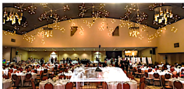
Khorassan Room location of New Product Expo

1707 Country Acres Drive, St. Peters, MO 63376 e-mail: ncrc@stlouiscsi.org , phone 636-447-1357