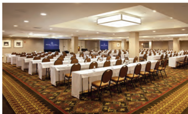
Meeting rooms location of educational tracks

Interested in a tabletop, please visit csincr.org/conference